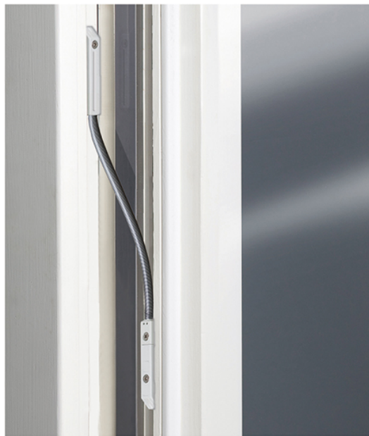
M 13 35 miniature door loop for concealed installation