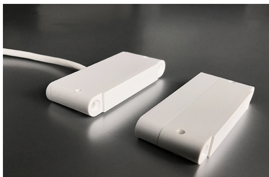
EKOM 22 contactless electronic transmitter